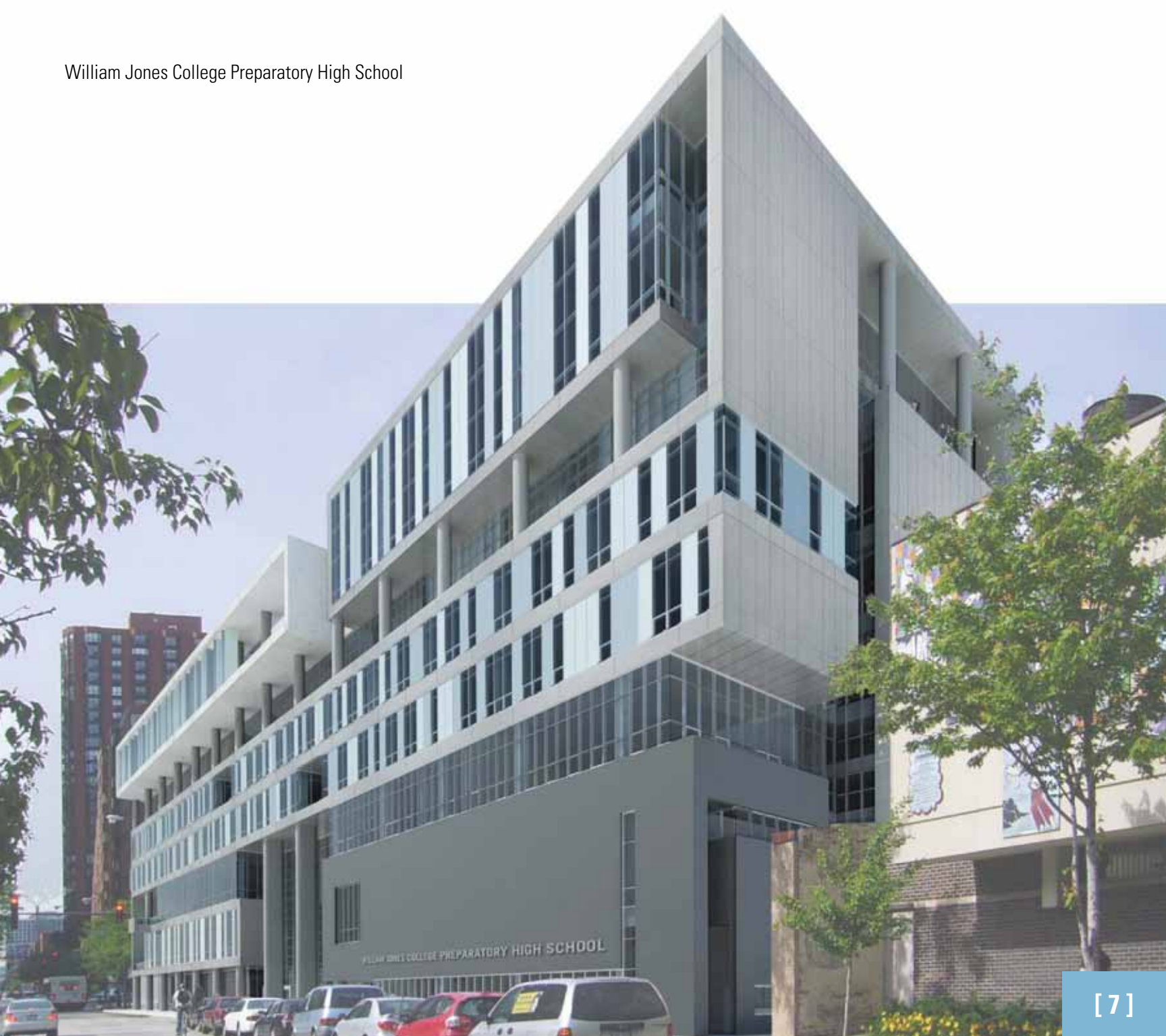
William Jones College Preparatory High School