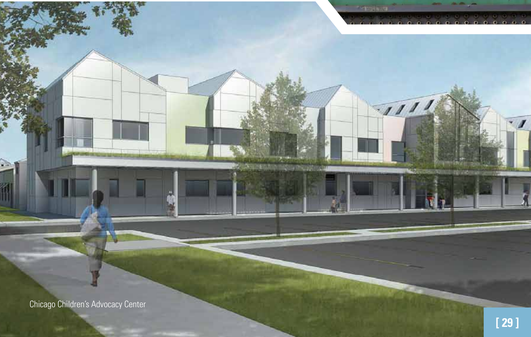
Chicago Children's Advocacy Center