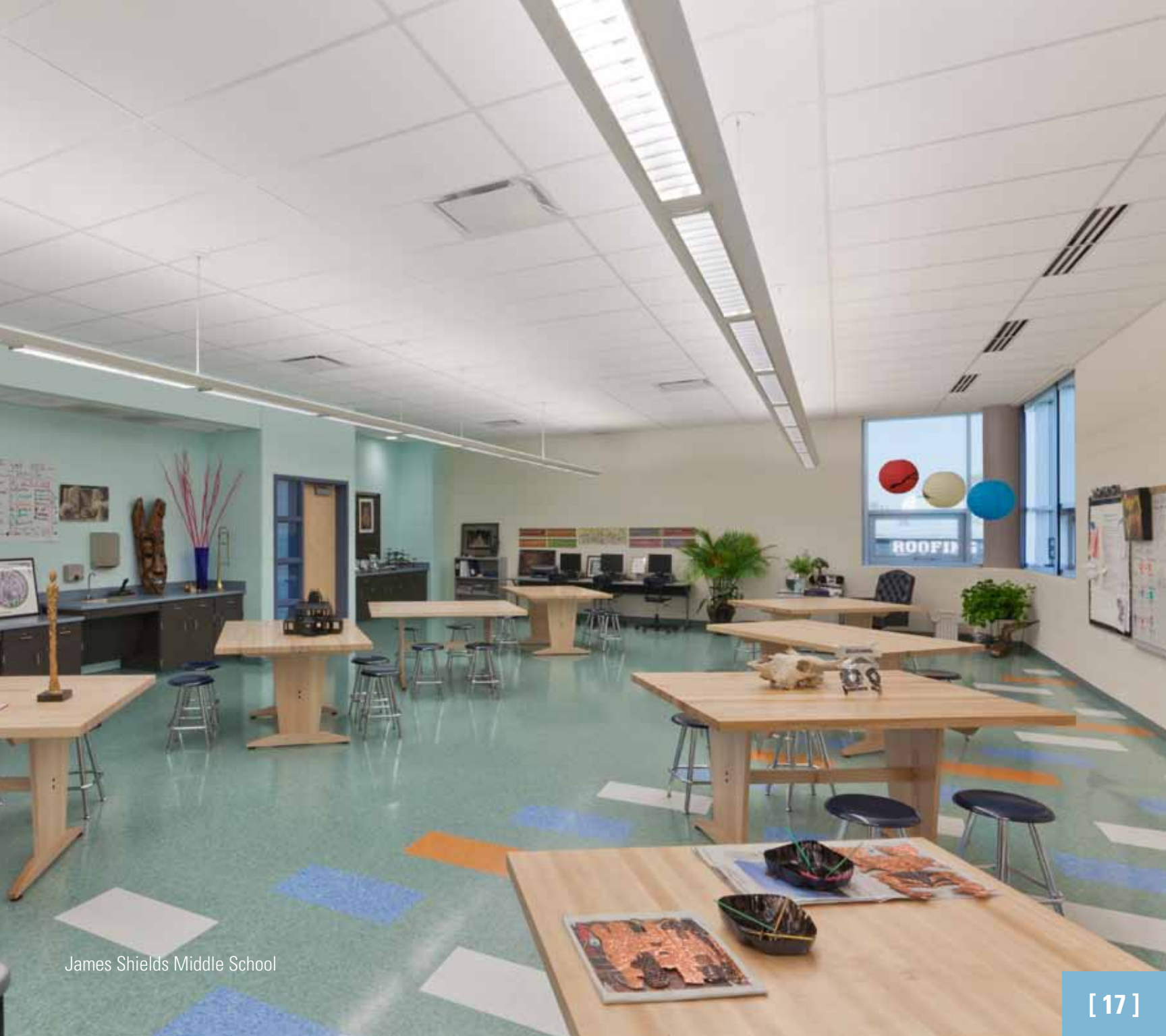
James Shields Middle School