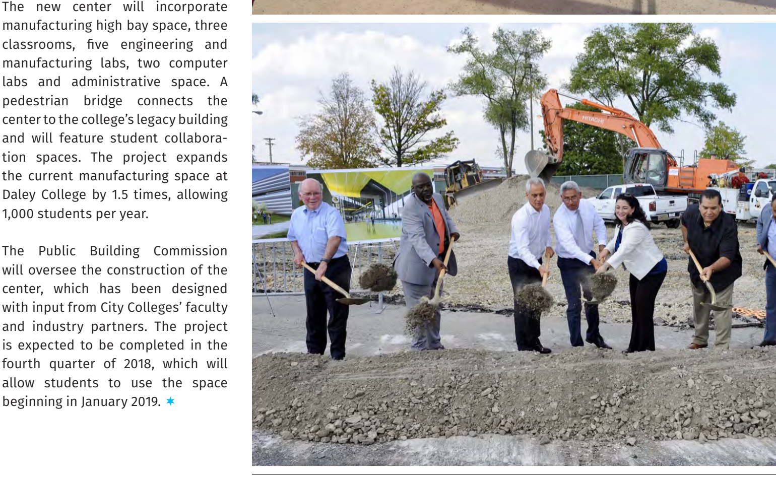
Previous spread: rendering of the new Daley College Engineering & Advanced Manufaci speaks at the groundbreaking event; breaking ground at the new site; aerial rendering