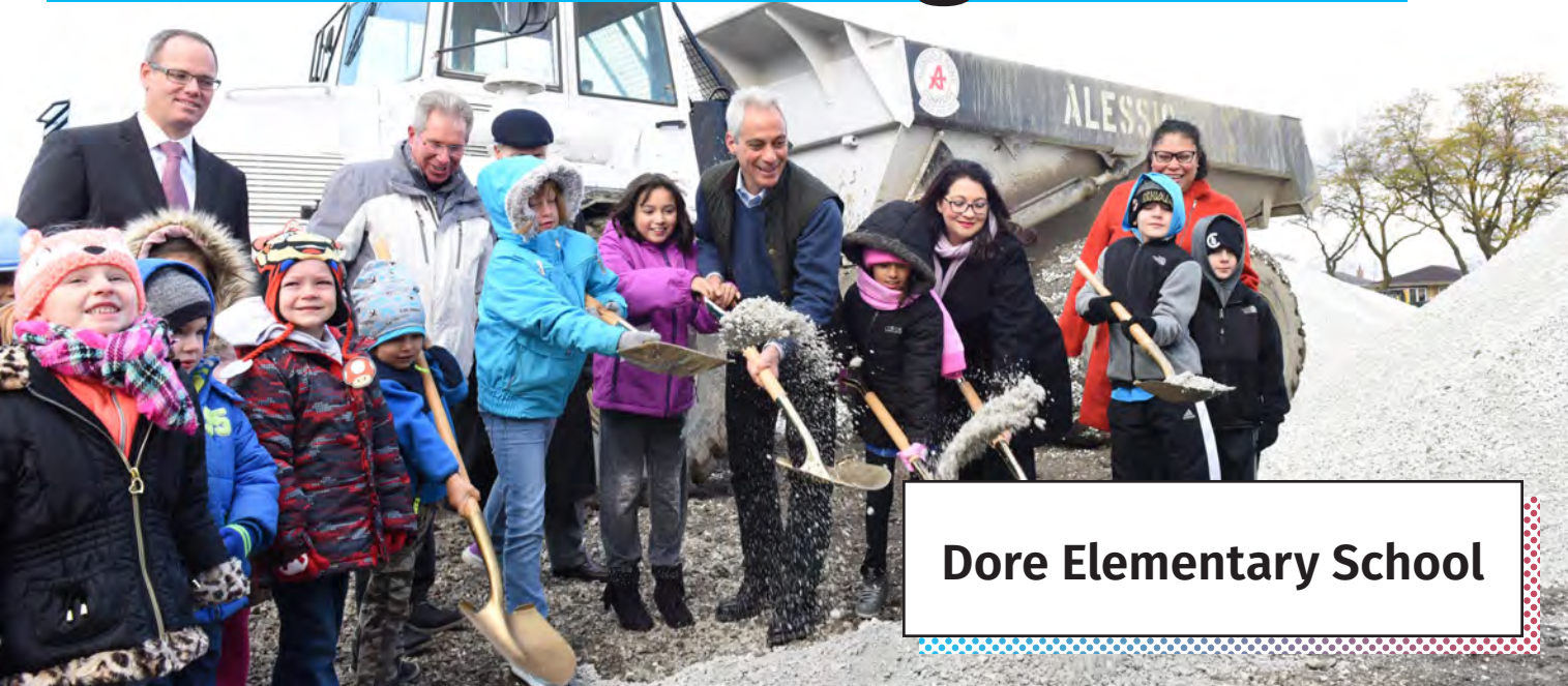
Dore Elementary School