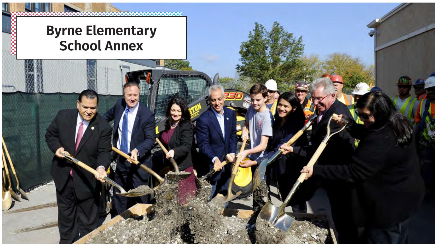
Byrne Elementary School Annex