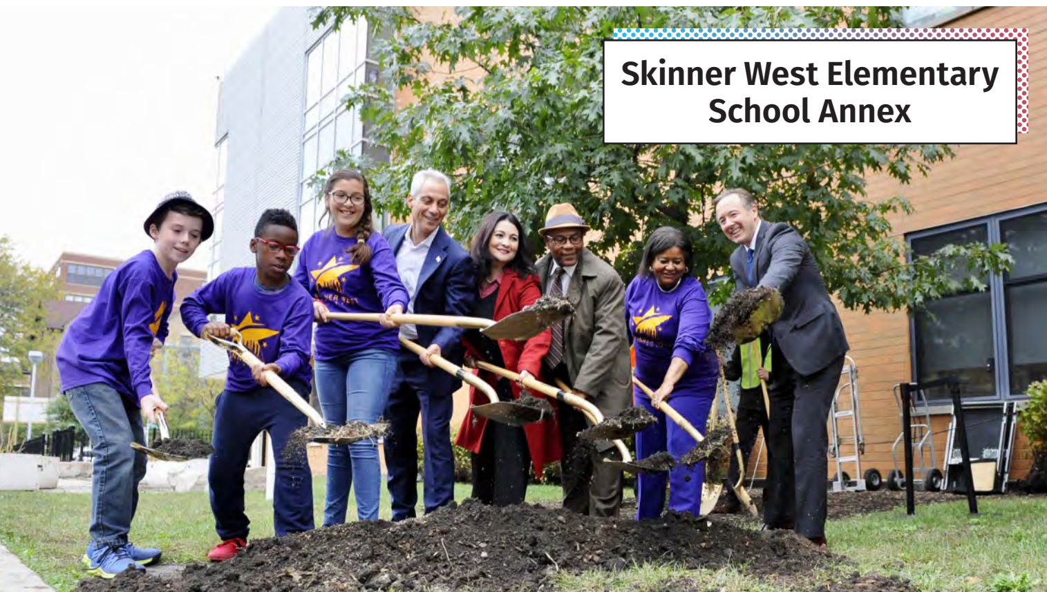
Skinner West Elementary School Annex